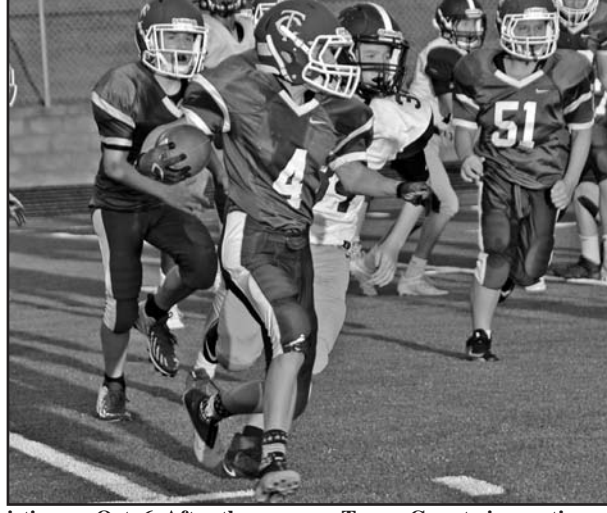
The TCMS Indians fell to Bethlehem Christian on Oct. 6. After three games Towns County is sporting a l-2 record with one final game remaining this Thursday at Lakeview Academy.